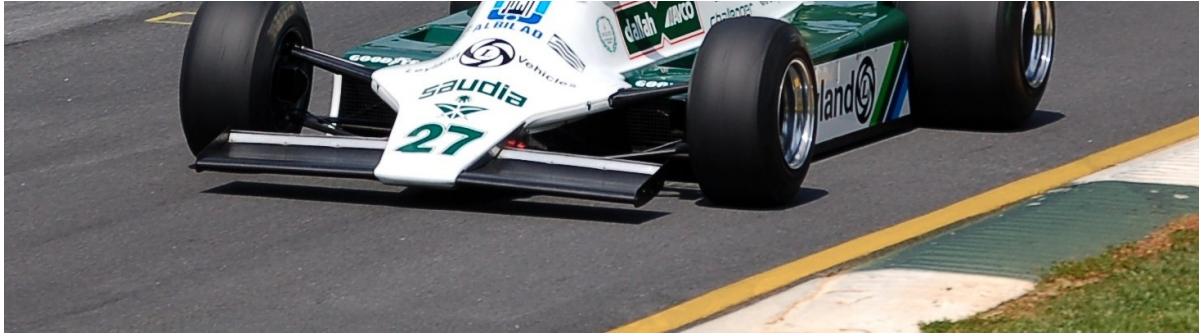
1981 Williams FW07 B Formula 1 / SOLD