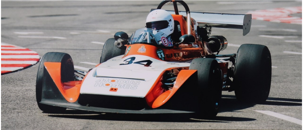
1975 Modus M1 F3 SOLD