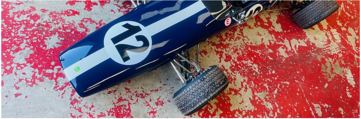
1968 Merlyn Mk14 F3