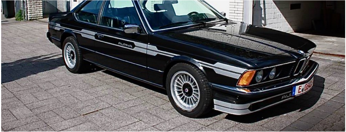
1978 Alpina BMW B7 Turbo Coupe Available Soon.