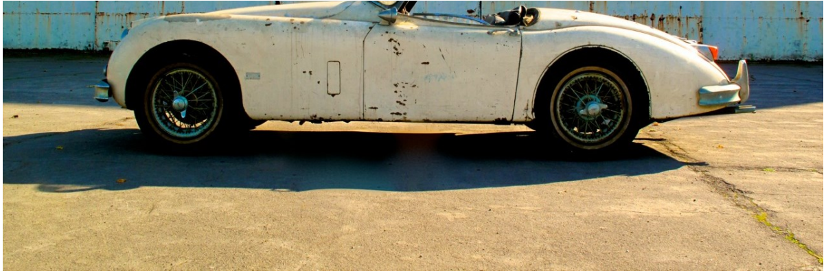
1958 Jaguar XK150 S Roadster